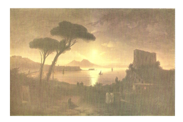
Aivazovsky's painting, The Bay of Naples by Moonlight. 1842. Aivazovsky's most Claudian landscape (see text above)

Whereas Goethe's lofty, Faustian bliss is only envisaged in a future moment which might be won only by the "ultimate good", Turner's "sublime moment" is a felt reality "by art betrayed" but won, nevertheless. Even at 67, metaphysical bliss was beyond the reach of the sense-wrought artist, Turner, even though it touched the threshold of his colours. But that bliss was in abundance in the mature, disciplined will, classical skill and character of the art of the young Aivazovsky— an art luxuriating in romantic subject matters notwithstanding. That was, I believe, what fascinated and inspired Turner, the "magnificent giant of English painting" (Herbert Reed), to write a poem in praise of his young colleague, Aivazovsky.