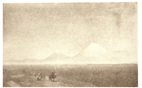
Aivazovsky---The Valley of Mount Ararat. 1882