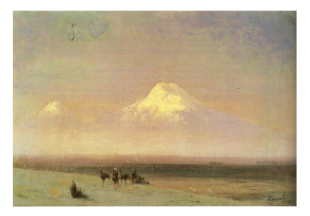
Aivazovsky.---- Mount Ararat . 1885

But in 1887, Aivazovsky too, like Turner, painted mount Ararat's biblical theme of 'after the Deluge.' He named it simply as Noah Descending from Ararat . As mentioned above, the subject matter in Turner's painting of Ararat after the Deluge is swept up in the dynamic vortex of regeneration. In Aivazovsky, the vast emptiness of the world-universe after the Deluge, the majesty of mount Ararat and the chilling serenity of the disciplined descent of the survivors, all breathe Biblical inevitability. Moreover, in the Aivazovsky oil painting Noah's group has chosen to bend the path of the caravan in a semicircle (the painter has modified the straight path of the caravan in his initial sketch.) The Patriarchal group is pushed further away from his followers, in an anticlockwise motion, towards the right, thus creating a guiding momentum for the bewildered survivors in their descent.