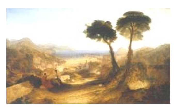
Turner's painting: The Bay of Baiae, with Apollo and the Sibyl. . Exh. BA 1823

Oil, 92 x 141 cm. now at Aivazovsky Gallery, Theodosia.