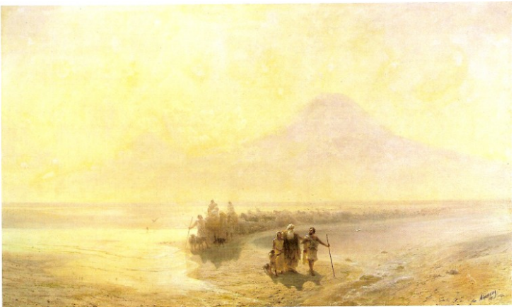
Aivazovsky---- Noah Descending from Ararat. 1887 Oil, 128 x 218 cm. Painting Gallery of Armenian. Yerevan

Nothing indeed could exemplify better the difference between the two painters as these paintings pertaining to the biblical events before and after the Deluge. Their formal and pictorial treatment of the same subject matter by both artists created the opposites in the classic-romantic dialectics of the spectrum of art.