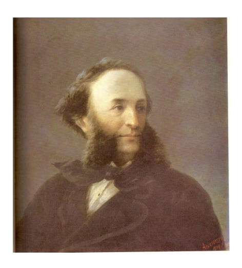
Aivazovsky's Self-portrait . 1874 Oil, 74 x 58 cm. Uffizzi Gallery, Florence.