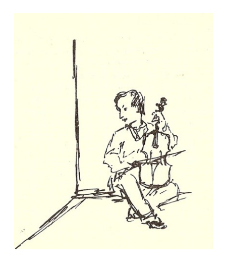
Aivazovsky's sketch/impression of himself as a young man playing the violin-oriental style. 1887.