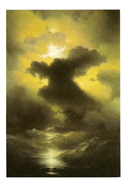
Aivazovsky's painting, Chaos—The Creation of the World. 1841.